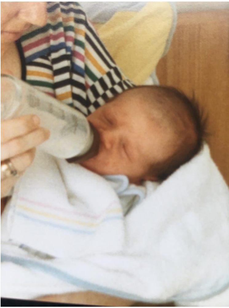
"the author not receiving breastmilk"